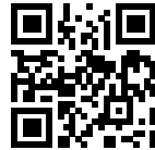
Qal'at Al Bahrain Site Museum